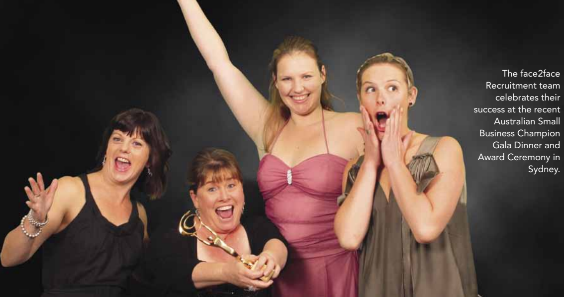
The face2face Recruitment team celebrates their success at the recent Australian Small Business Champion Gala Dinner and Award Ceremony in Sydney.